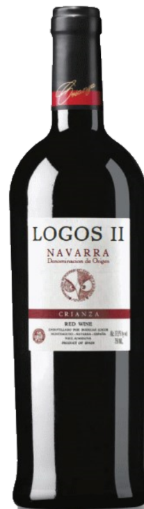
Logos II Blend