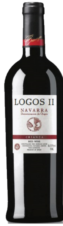
Logos II Blend