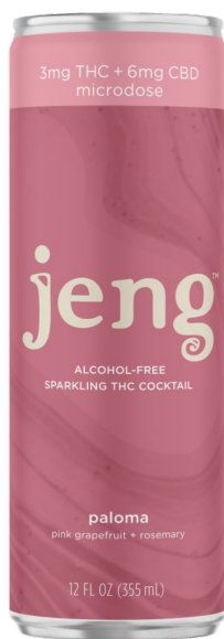
Paloma Pink Grapefruit Rosemary