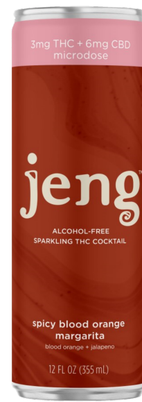
Spicy Blood Orange Margarita Blood Orange Jalapeño