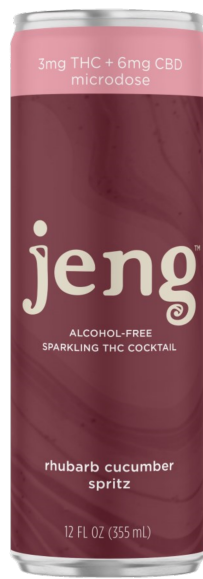
Rhubarb Cucumber Spritz