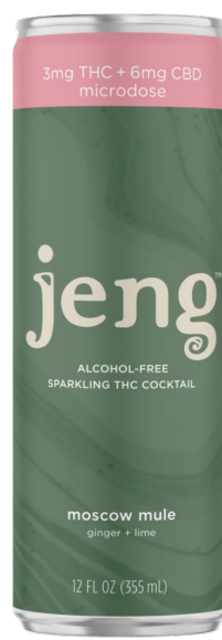
Moscow Mule Ginger Lime