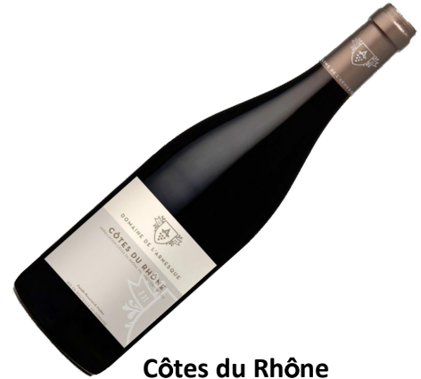
Côtes du Rhône