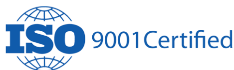
INTERNATIONAL QUALITY STANDARD CERTIFICATION