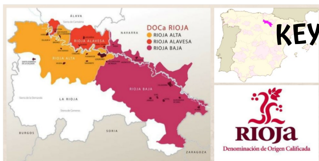
ONE OF SPAIN'S TOP WINE REGIONS