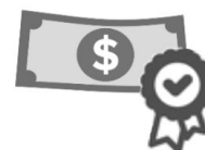
EXCELLENT PRICE TO QUALITY RATIO