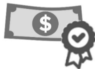
EXCELLENT PRICE TO QUALITY RATIO