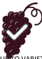
TRUE TO VARIETAL